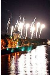
Festival des Arts de la Rue

http://www.libourne-tourisme.com/en/activites/fetes-et-manifestations.html